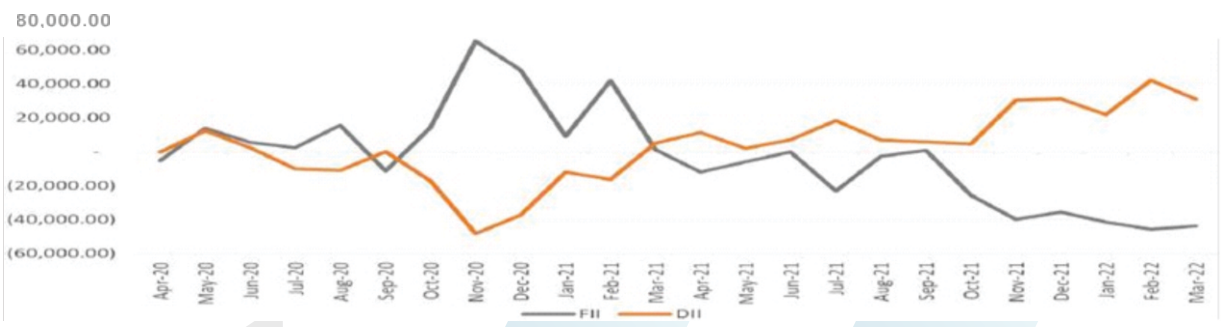
FII DII Cash Movement

The FII selling has coincided with the increasind FED rate hike probability as the probability of hike has increased since October so has the selling intensified as shown in the below chart.